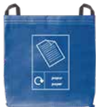
Dark blue bag