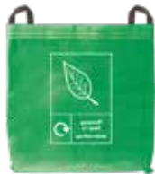
Green dumpy sack

Contact us to register for this chargeable collections service