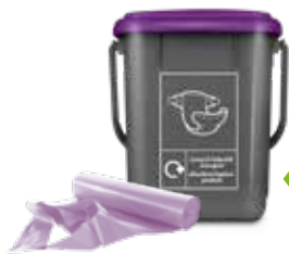
Black caddy with purple lid and single-use purple sacks