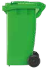
Green wheelie bin